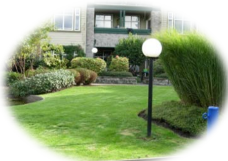
PORT ROYAL – NEW WEST