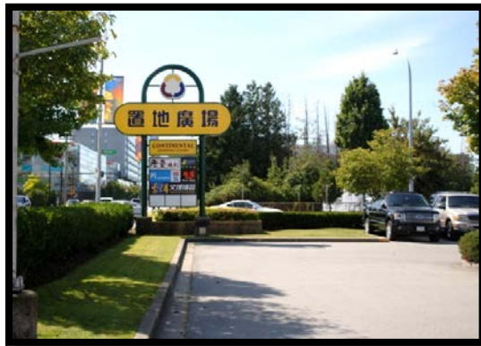
CONTINENTAL CENTRE - RICHMOND