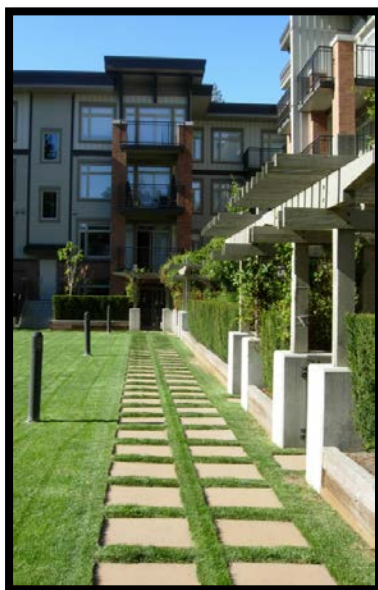
CHAUCER HALL – UBC