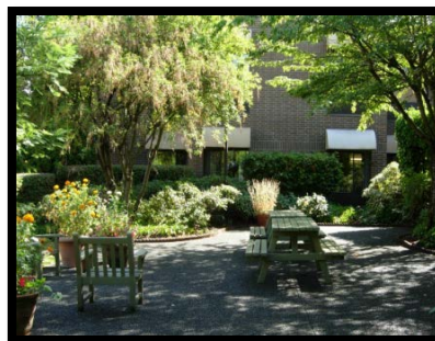
LIONS GATE HOSPITAL – NORTH VANCOUVER