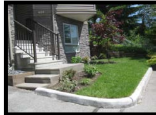
FRONT OF UNIT 401 - BEFORE