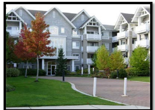
VICTORIA PARK – RICHMOND